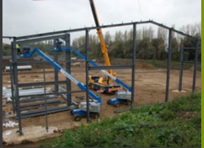
6. We are well advanced on clearance of old and unsafe structures on one of our key development sites within the Enterprise Zone to be called Plot 9000.

WITH SIX KEY DEVELOPMENTS UNDERWAY AND THREE DIFFERENT CONTRACTORS WORKING ON SITE, WE ARE ENTERING INTO OUR BUSIEST PERIOD OF DEVELOPMENT AT WESTCOTT.