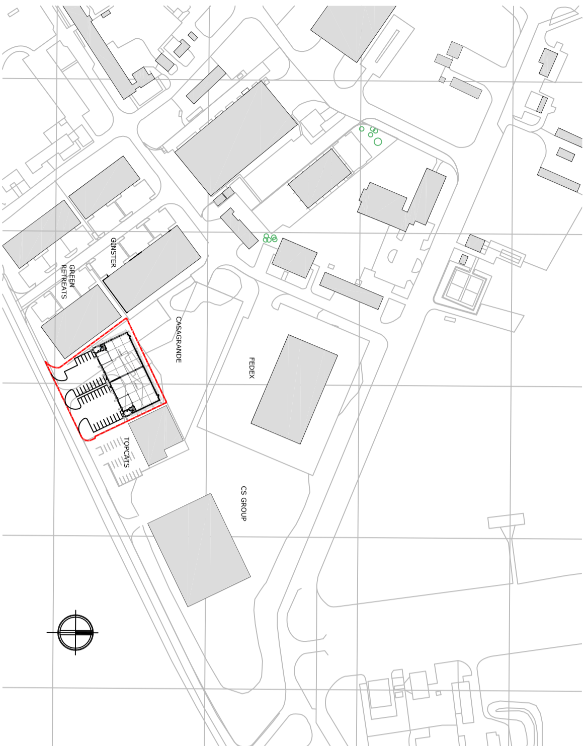
SITE LOCATION PLAN 1:2500