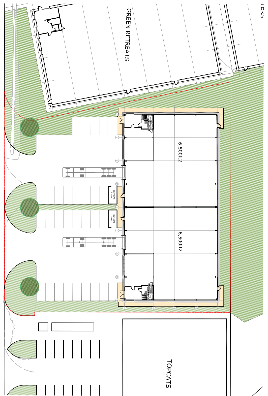
SITE LAYOUT PLAN 1:500